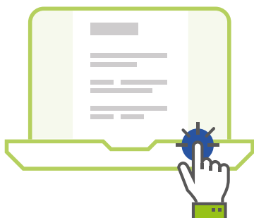
HR Documents in a snap