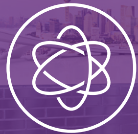
ACCENTURE INNOVATION CENTER