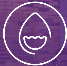
ACCENTURE LIQUID STUDIO