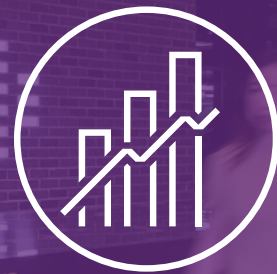
ACCENTURE DELIVERY CENTER