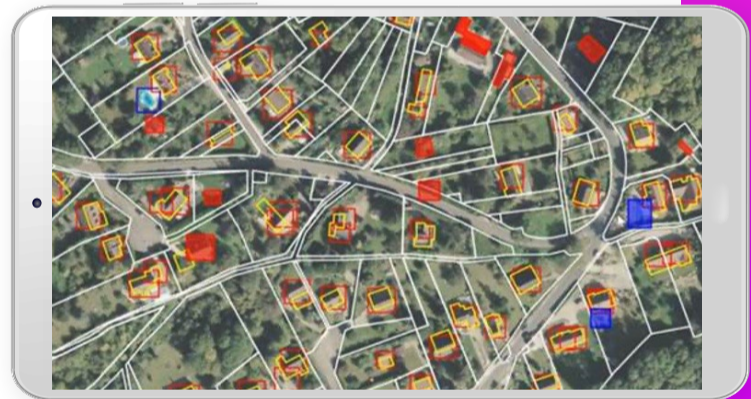
Image automation applied to satellite imagery identifies and flags outliers that need human intervention.

Image Automation to provide real-time alerts and insights through accurate analysis of satellite, aerial or other imagery, and video content.