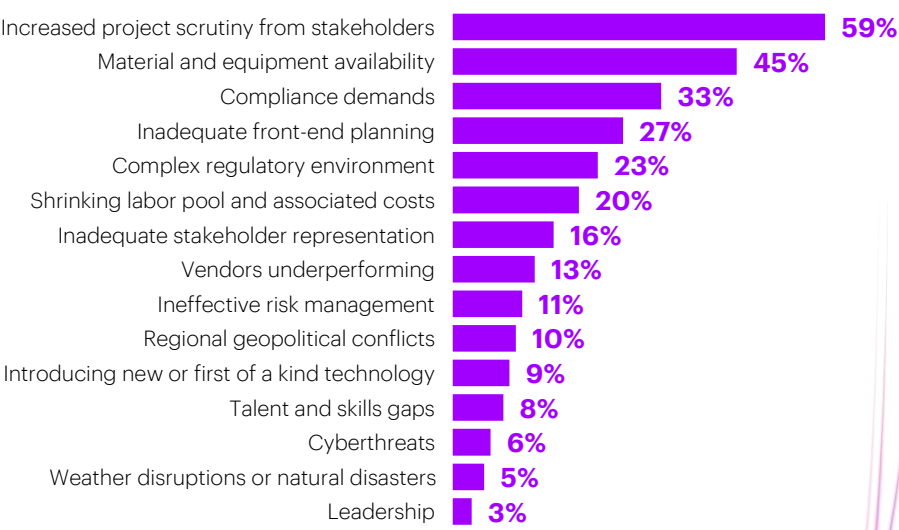
Main factors contributing to cost overruns and schedule delays